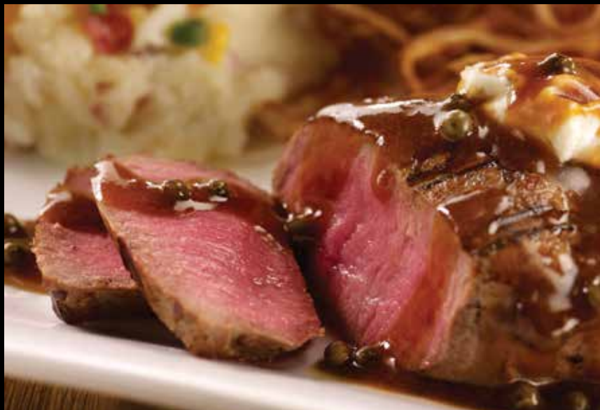
Peppercorn New York Strip*