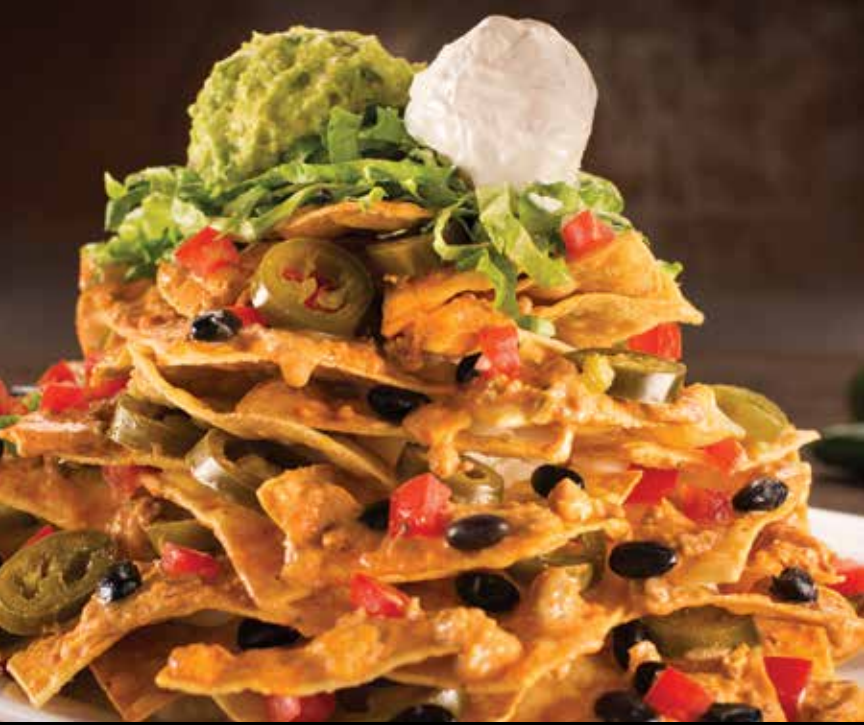
Mountain O' Nachos