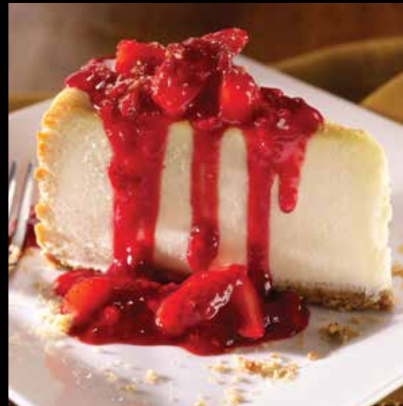
Rich & Creamy Cheesecake