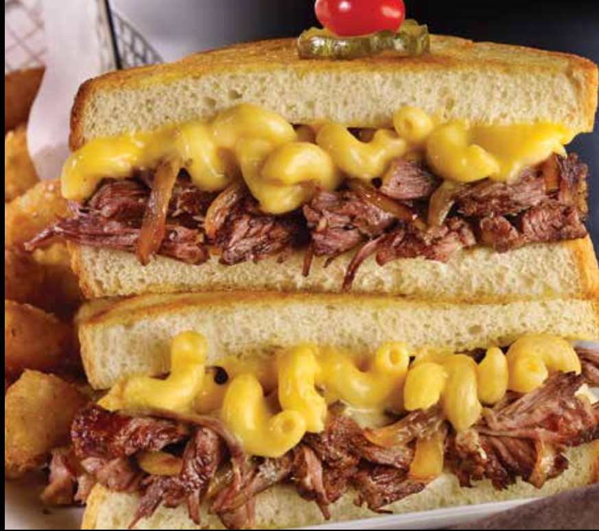
Short Rib & Cheesy Mac Stack

Substitute fries for the salad for no additional charge.