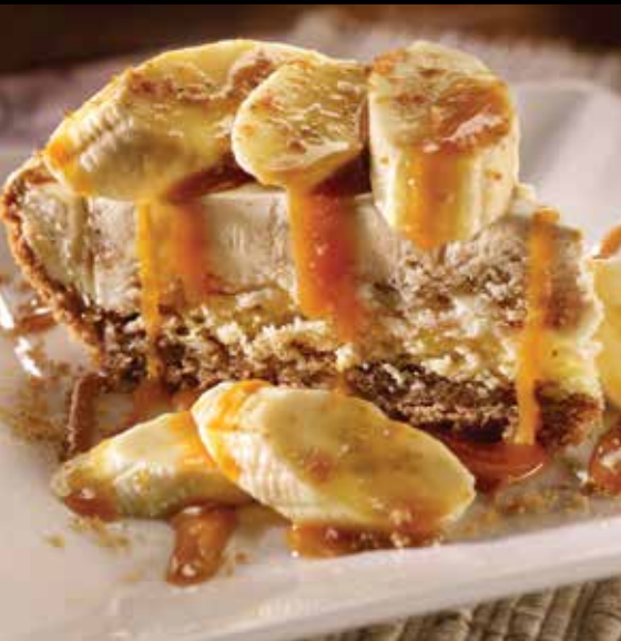
Bananas Foster Pie