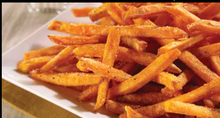
Sweet Potato Fries