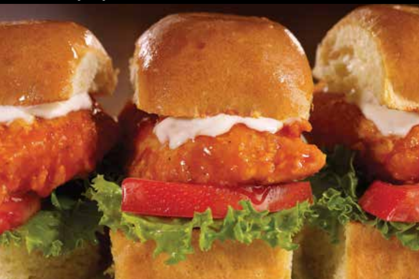
Buffalo Bar Chicks