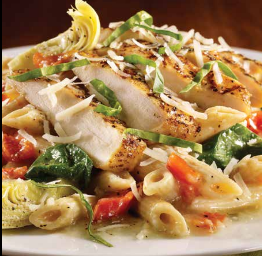
Grilled Chicken & Artichoke Penne

Flame-grilled seasoned chicken breast and applewood smoked bacon, tossed with cavatappi pasta and creamy aged sharp cheddar cheese sauce. Topped with a garlic breadcrumb crust and baked until brown and bubbly.