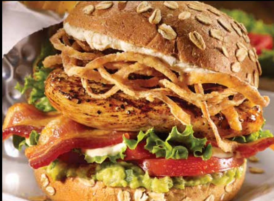
The Boss Chicken Club