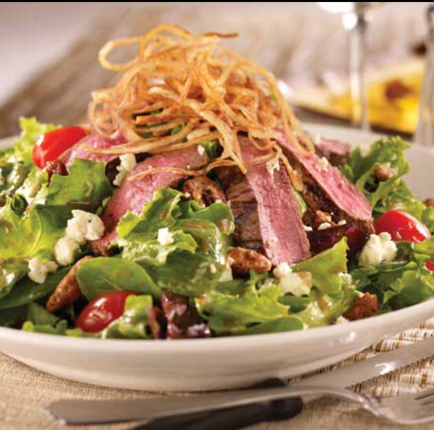
Grilled Steak Salad*