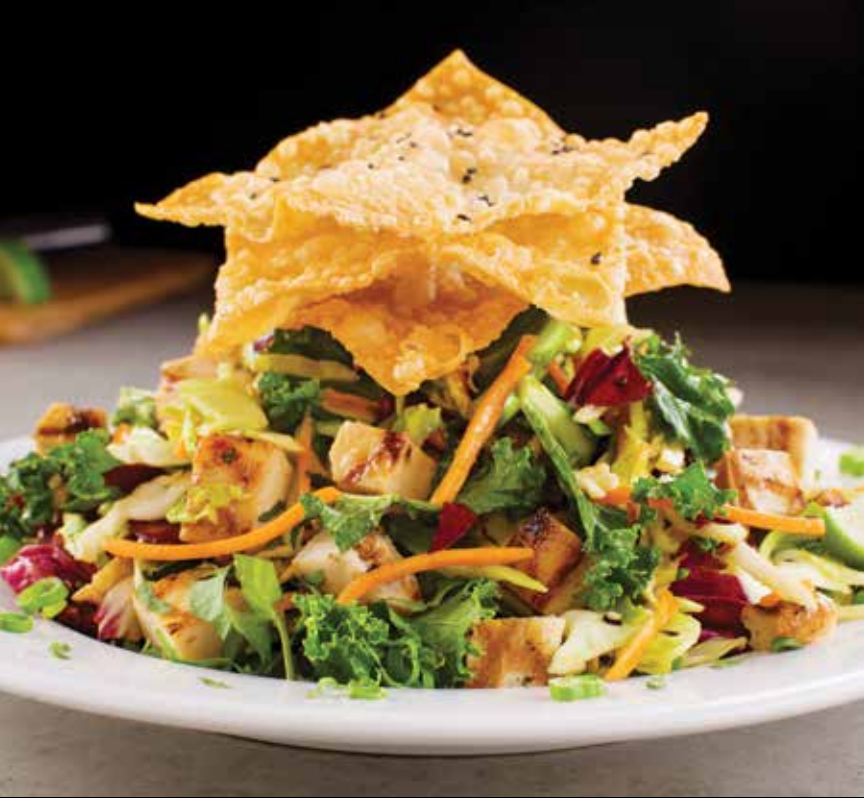
Thai Chicken Chopped Salad