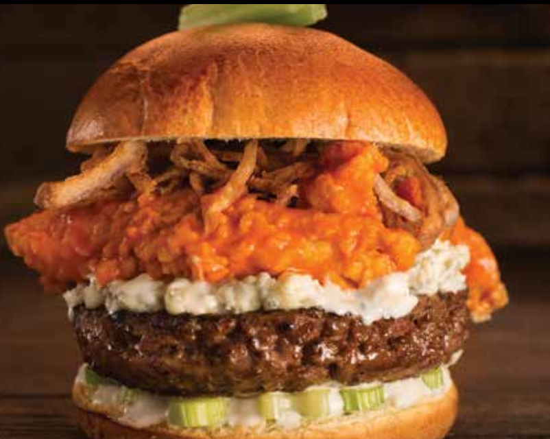
Buffalo Wing Burger*