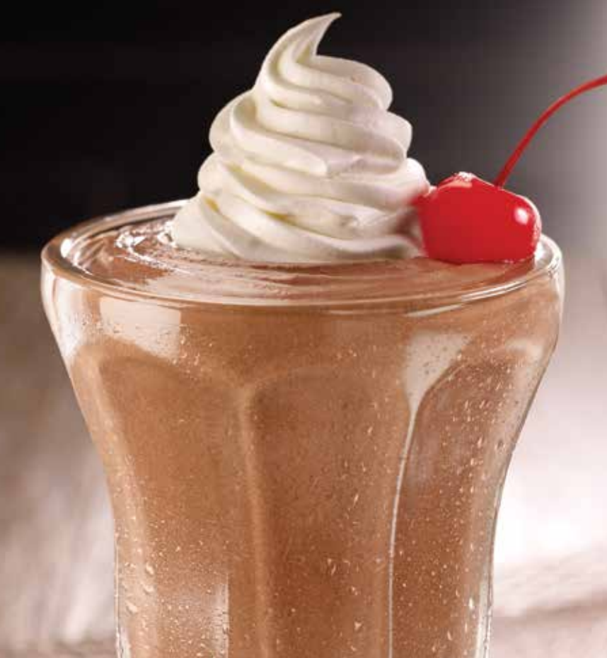
Handmade Chocolate Milkshake