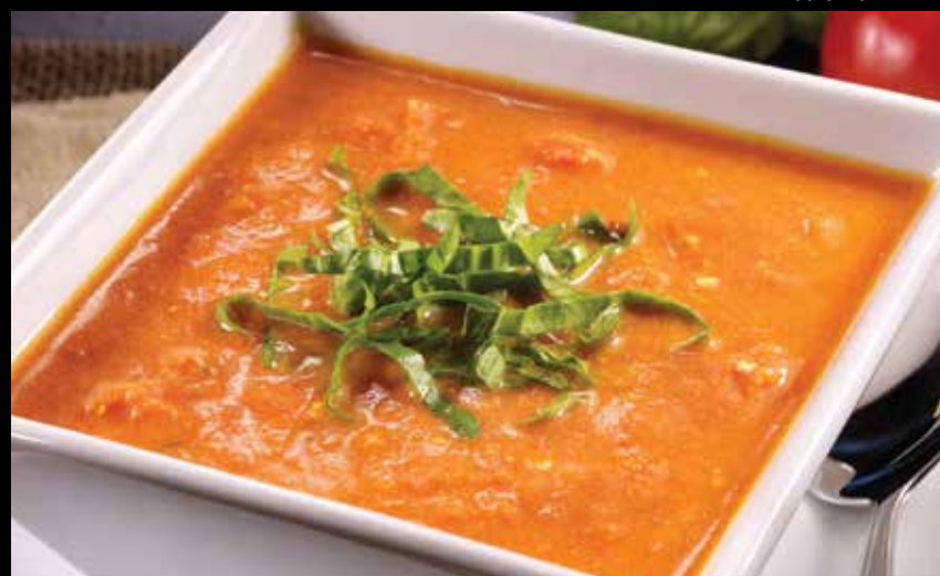
Tomato Feta Soup