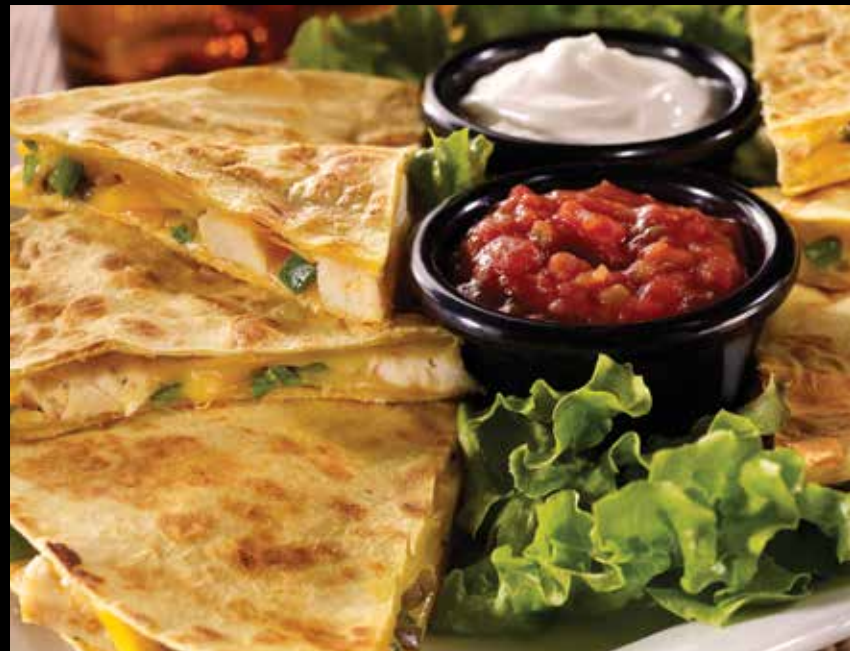
Grilled Chicken Quesadillas