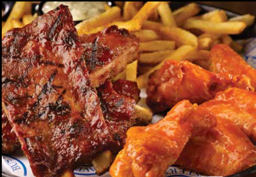
Smokehouse BBQ Ribs & Buffalo Wings