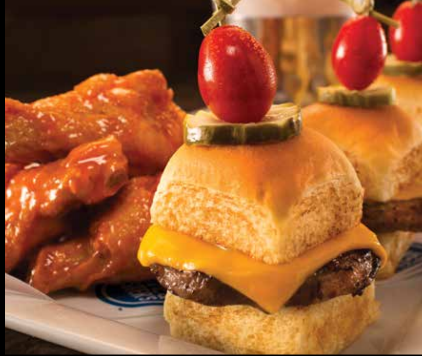
Bar Burgers & Wings Platter

Buttermilk Ranch, Roasted Garlic Caesar, Bleu Cheese, Honey Mustard, Balsamic Herb Vinaigrette, Raspberry Vinaigrette and Thai Ginger Peanut