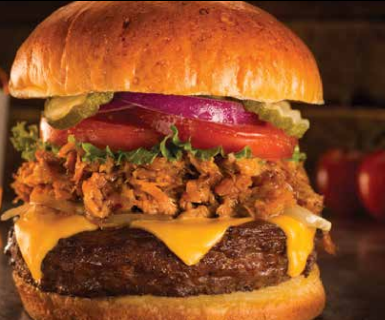
Maker's Mark® BBQ Burger*