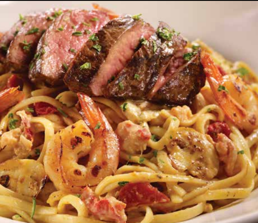
Bistro Steak & Shrimp with Lobster Alfredo*

8 oz. wild-caught, sustainably sourced Pacific cod filet, Bass® Ale battered and fried until golden brown and crispy, served with crunchy Parmesan-dusted house-made Yukon Gold potato chips and creamy malt vinegar aioli.