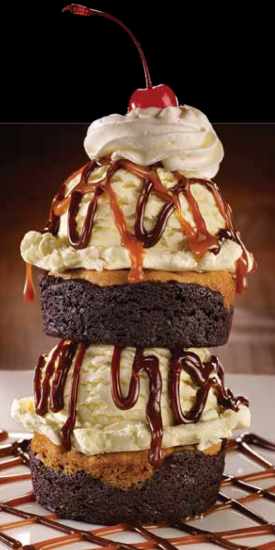
Brookie Sundae Tower

Our classic NY cheesecake with graham cracker crust. Served with warm caramel and pecans or with berry sauce.