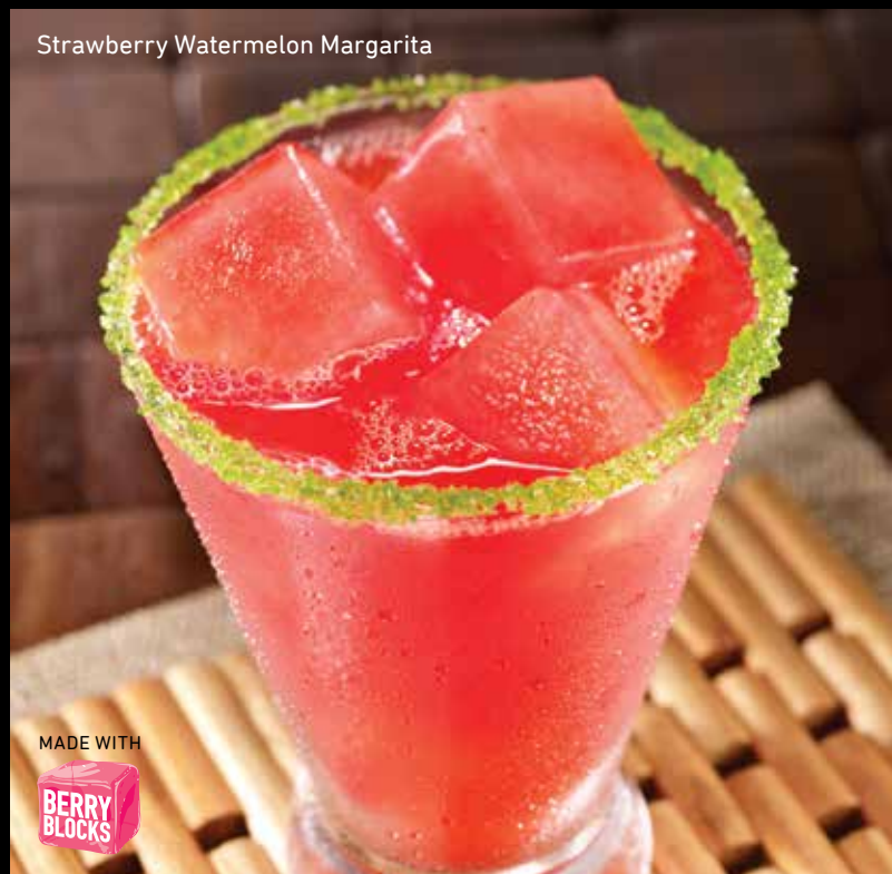
Strawberry Watermelon Margarita