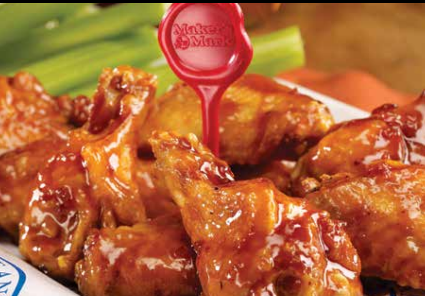
Maker's Mark® Sweet Honey BBQ Wings