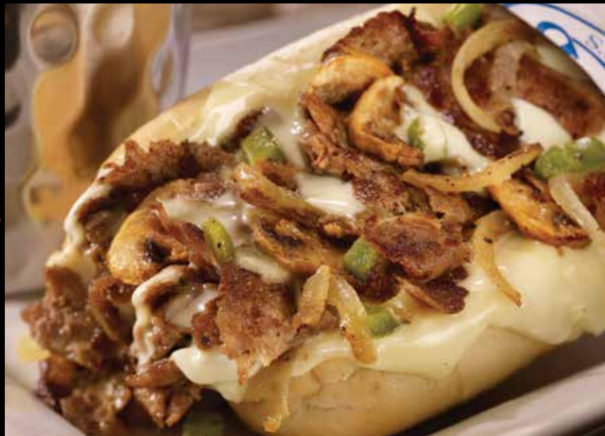
The Philly Cheesesteak