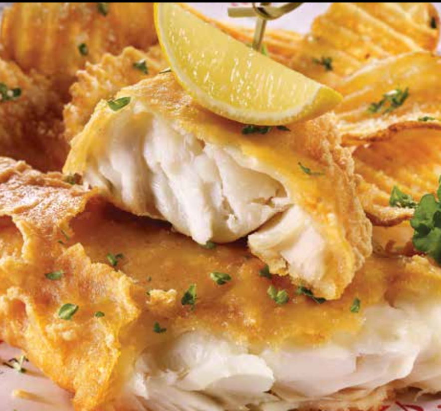
Bass® Ale Battered Fish & Parmesan Potato Chips

Serious surf AND the tastiest turf. We start with a 5 oz. fire-grilled sirloin steak on a bed of linguine, tossed with shrimp, mushrooms, roasted tomatoes and a lobster Alfredo sauce.