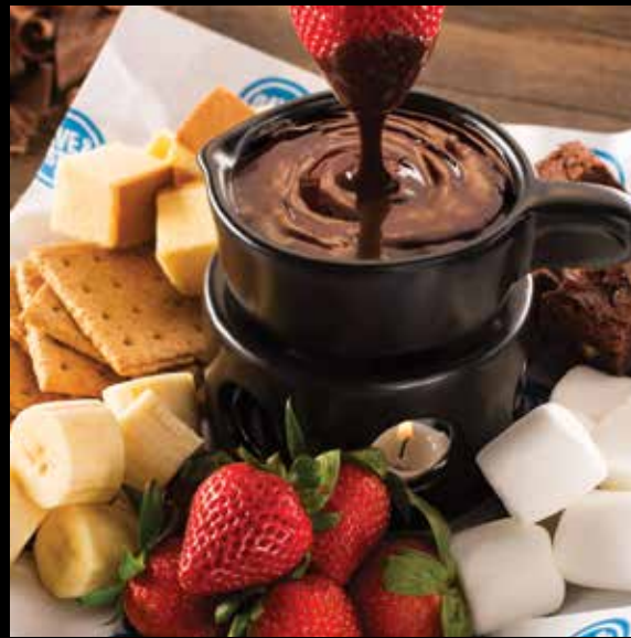
Decadent Chocolate Fondue