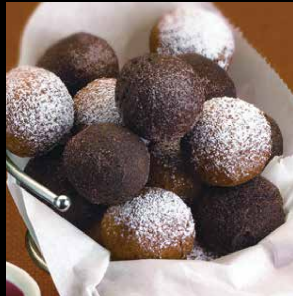
Hot & Sugary Donut Bites