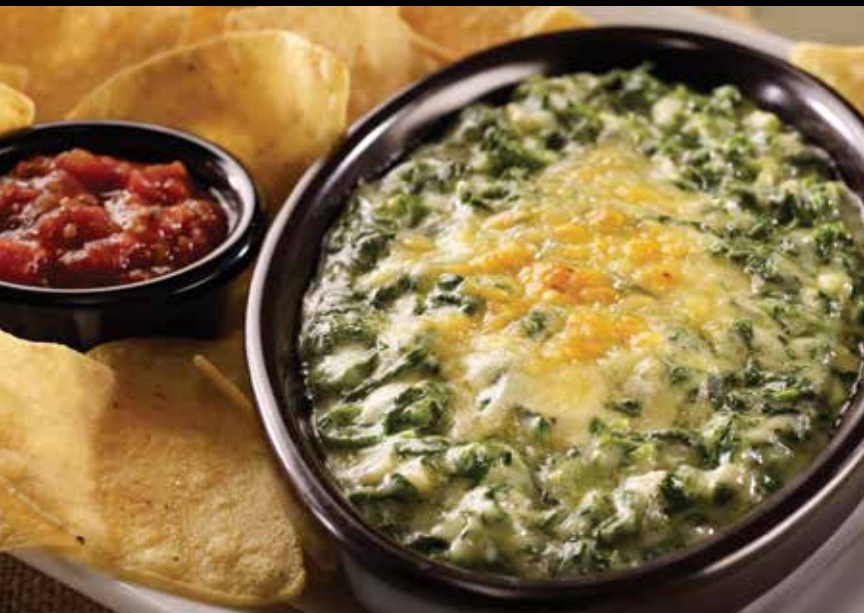
Cheesy Spinach Dip