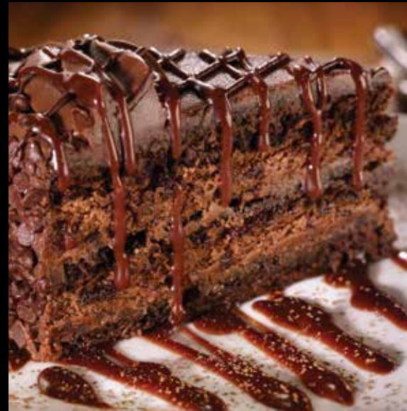
Triple Layer Chocolate Cake