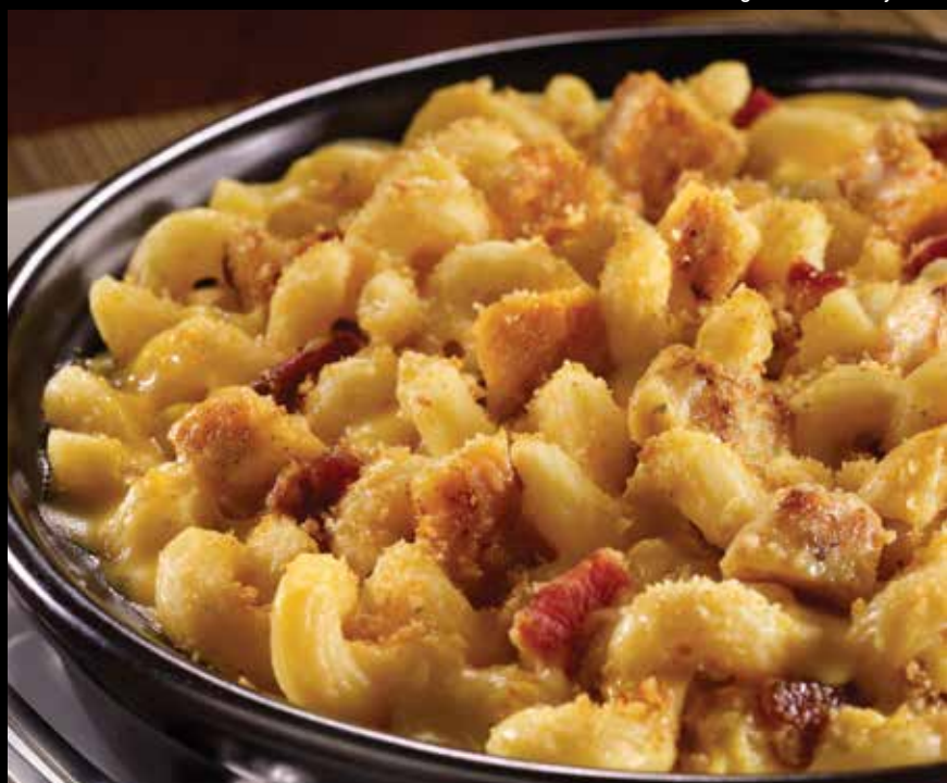
The Ultimate Mac & Cheese

Two 5 oz. flame-grilled chicken breasts topped with pineapple pico de gallo and served with spicy rice and steamed fresh vegetables.