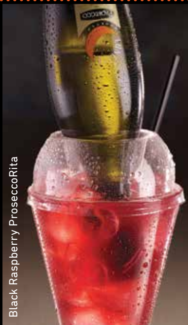
Black Raspberry ProseccoRita