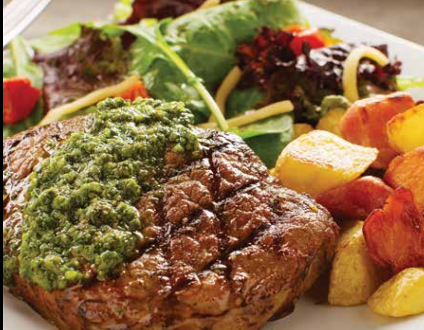
Chimichurri Sirloin Steak*

A half rack of our fall-off-the-bone "St. Louis-style" pork ribs glazed with our honey bourbon BBQ sauce, served alongside five jumbo chicken wings tossed in D&B's original buffalo sauce. Served with Bleu Cheese dressing and seasoned french fries.