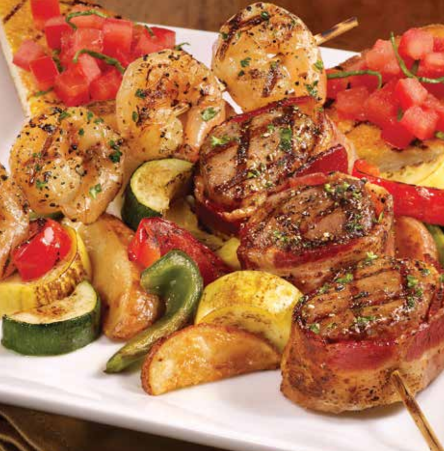
Bacon-Wrapped Sirloin Medallions & Grilled Shrimp*