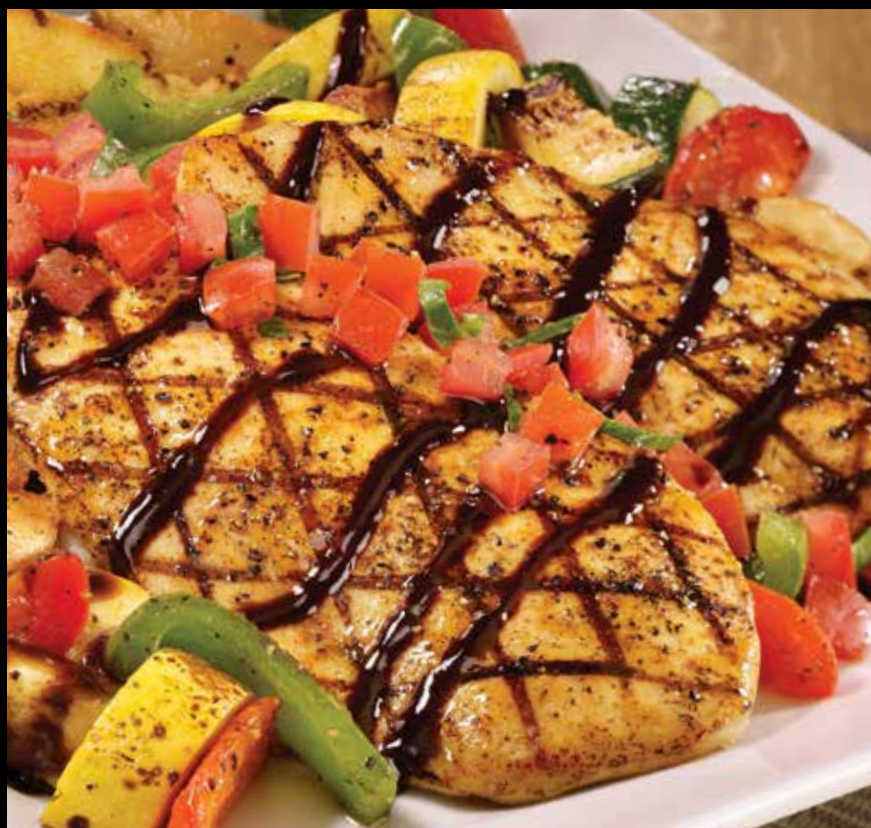
Balsamic Chicken & Vegetable Medley