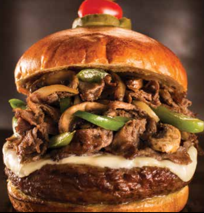
The South Philly Burger*

Crispy chicken tenders tossed in our original wing sauce, topped with Bleu Cheese dressing, lettuce and tomatoes. Served on buttery mini brioche buns with seasoned french fries.